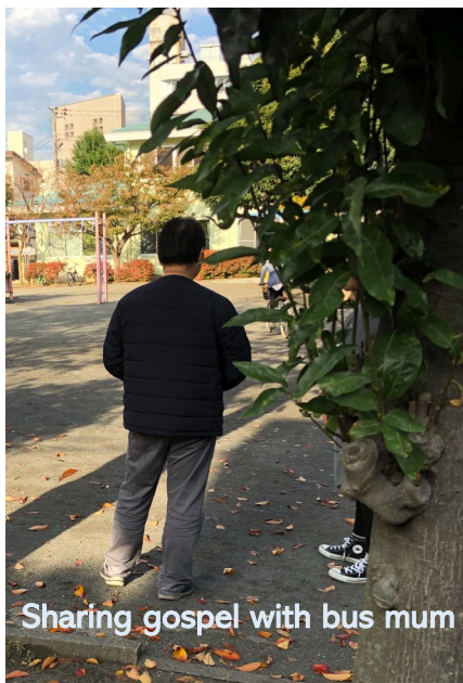
Sharing gospel with bus mum