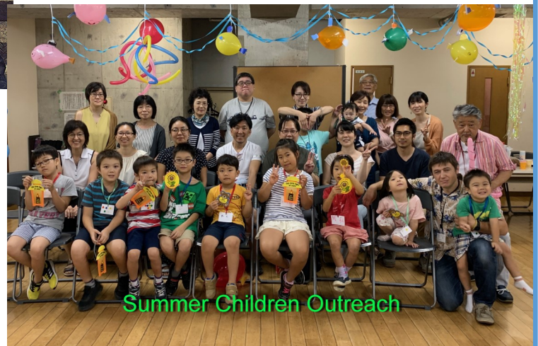
Summer Children Outreach