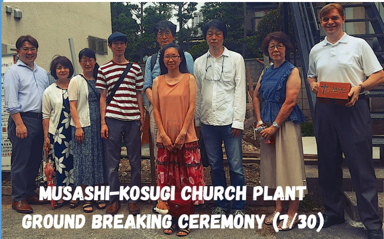
MUSASHI-KOSUGI CHURCH PLANT GROUND BREAKING CEREMONY (7/30)

Pray for team unity -Our team have four families. We came from very different background. Our team leader has been in Japan for 20 years, and one family have been in Japan 7+ years, another family have been in Japan 3 years. We are the youngest, been in Japan for one year. It is God's grace that we can become a team, However, how to work together is what we need to learn. We need God's constant guidance and unity in the spirit. Please pray for us, so we can have good communication and be guided by the Holy Spirit, so we can have strategy and plan that really came from the Lord.