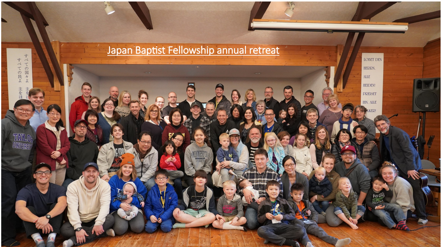
Japan Baptist Fellowship annual retreat

We thank the Lord for His blessing. Over the past few years, our mission group has grown significantly. We have about 20+ units now and continue to grow. Many missionaries who have been on the field for more than 20 years says, over the past 10~15 years, there aren't that many new missionaries come to Japan. However, things begin to change for about 3 years ago. They thank the Lord for years of long prayer been answered. Other possible reasons perhaps are due to the 2011 Tohoku earthquake God did call and move many more people to respond to that tragedy. Many missionaries have since come to Japan. Every year our mission group in Japan have an annual retreat, we thank the Lord for such wonderful fellowship. For more information please take a look our mission group website. http://www.jbfjapan.com/