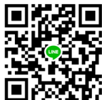
Line prayer group

We thank you for your ongoing support and care, we also hope to connect with you and get to know you more. If you have any prayer request, please send us an e-mail, so we can pray for you.